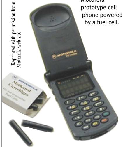
Motorola prototype cell phone powered by a fuel cell.